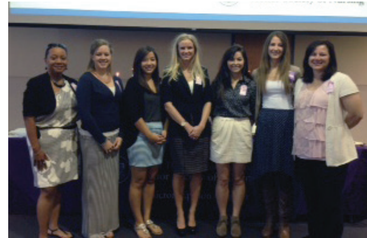
A HANDFUL OF THE 41 STUDENT OMICRON EPSILON CHAPTER INDUCTEES PAUSE FOR A PHOTO DURING THE EVENT.

One area within the Nurse Anesthesia program Cromer plans to further expand is developing the perspective of the clinical sites, so they “see themselves as an extension of the program where we value their input and encourage their participation in all aspects of our program.”