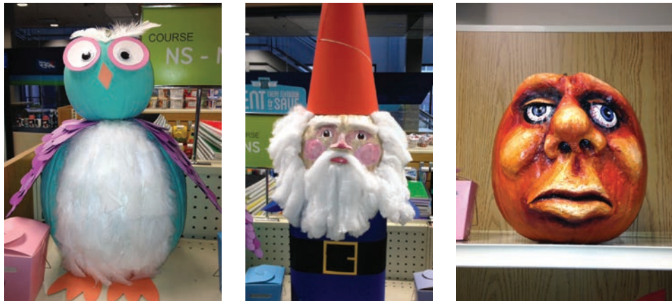
ABOVE, COUNTER CLOCKWISE FROM TOP, A FEW OF THE PUMPKIN CONTEST ENTRIES ON DISPLAY AT THE BOOKSTORE. THE OWL SWOOPED IN TO WIN FIRST PLACE. THE GNOME PROUDLY TOOK SECOND PLACE. THE SCULPTED FACE TOOK THIRD PLACE PRETTY SERIOUSLY.