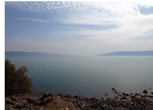
FROM TOP, THE WAILING WALL IN JERUSALEM & THE SEA OF GALILEE.