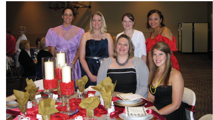
THE WEDDING DAY TABLE WAS DRESSED TO THE NINES FOR LAST YEAR'S TABLE TRIVIA BRUNCH.