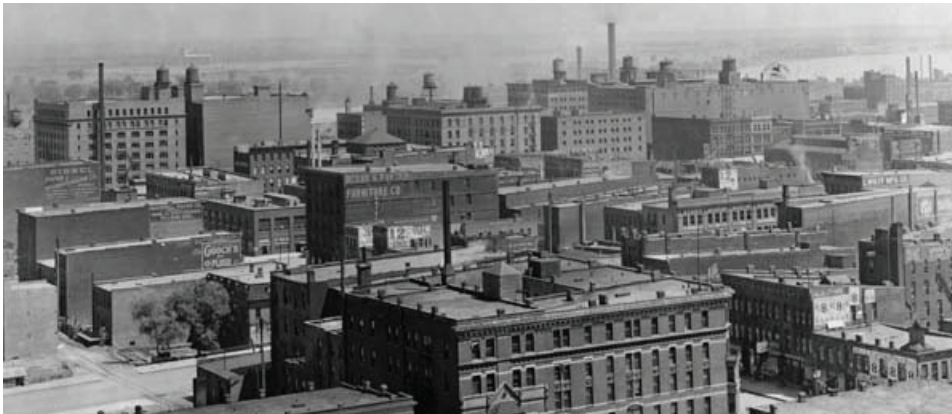
THE SOUTHWEST CORNER OF 11 & DOUGLAS STREETS IN THE LATE 1880S.

QUARTERLY CLARKSON COLLEGE ALUMNI NEWSLETTER